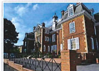
Astell Residential Home: 01242 529012