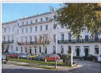
Faithfull House: 01242 514319

Please come and join us for coffee, cake and the opportunity to gain an understanding of what the 7 stages of Dementia are, whether you care for a loved one or simply deal with members of the community who are facing the early signs of dementia.